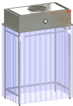
PVC curtain 4 side