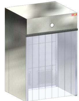
PVC curtain 1 side